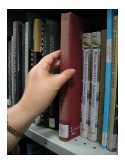
Always push the books on either side back and pull out volume from the middle of the spine.