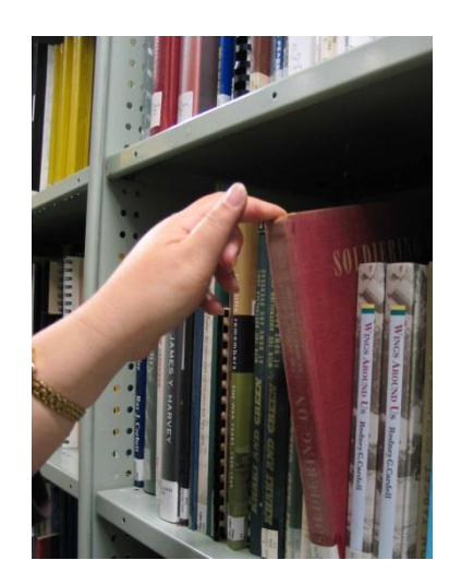
Never remove a book by the top of the spine as this can cause significant spine damage.